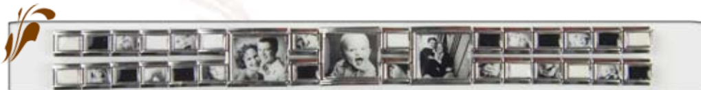
*Double Strand w/ three large Italian charms.