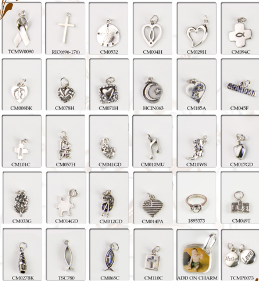
PHOTO CHARM: Add extra memories to your bracelet with this mini add on photo charm. Image size is one half inch square.

Prices and availability of all items subject to change without notice